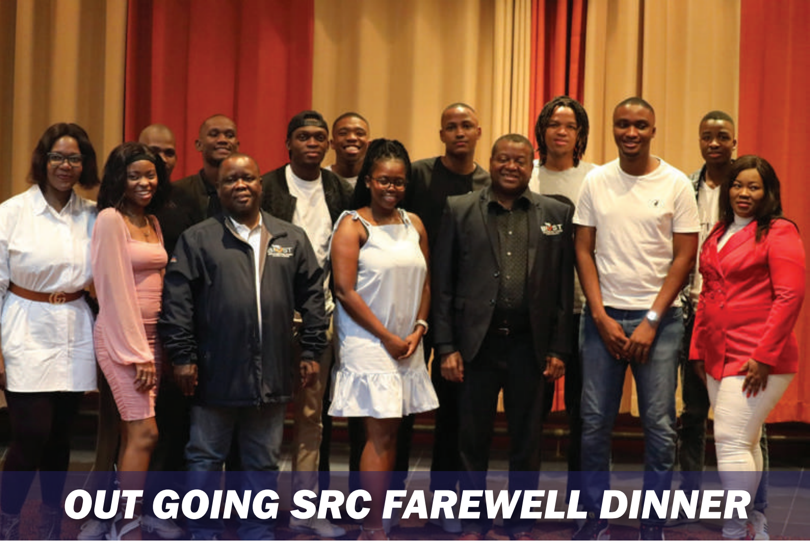
Outgoing cabinet posing for a group photo with BIUST Management

The Vice Chancellor's Office recently held a farewell dinner for the outgoing Student Representative Council Cabinet. The purpose of the event was to acknowledge them for the dedication and resilience they showed during their tenure as students' advocates.